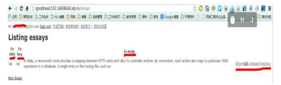
Figure 10.Short essay list view

vocabulary lists, and is specifically responsible for solving new word analysis The functional module of the problem.