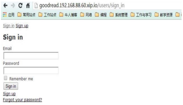
Figure 6.Site login page

The user management module of this system not only solves the problems related to user registration and login, but also meets the supporting role of some important functions of the system in the future. In summary, there are two: One is to ensure the configuration of more complex user permissions The second is the support for user account authentication of major mainstream systems. In the Rails community, there are more mature gems or combinations that support these two needs. Combining the suggestions of reference materials, I chose devise. This gem can be integrated with omniauth[26] (gem package that specifically supports third-party verification) to meet the needs of third-party authentication. It can be integrated with cancan to expand the requirements for permission settings and provide reliable guarantees for the project to go online as soon as possible. Effective support.