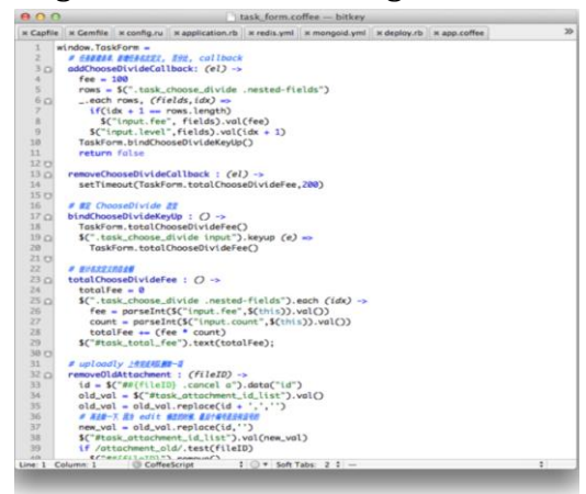
Figure 3. Rails development interface for TextMate 2