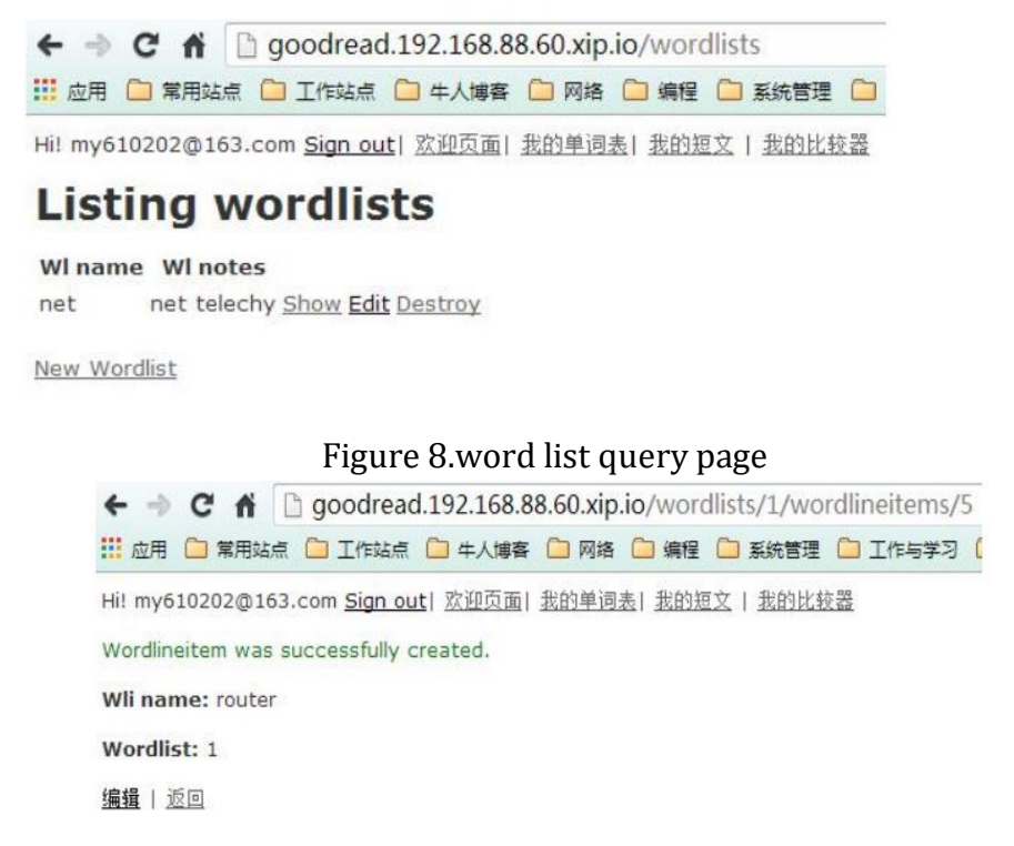
Figure 9.Show newly added words

The vocabulary management module is the basic module to realize all the functions of this project. It is mainly used to realize the function of self-management of private vocabularies by users. It has a one-to-one relationship with the user model, and it has a one-to-one relationship with short text management. The function realization of this module does not depend on a specific external system environment, and the rails core gem can realize the relevant functions. Similar to the user management module, it needs a back-end database to provide support for the data storage of the word list. The other functions of this module are implemented by ruby in the rails framework. The function of this module requires two models to implement specifically, one is the wordlist (wordlist) Model, a wordlineitem (word list item) model.