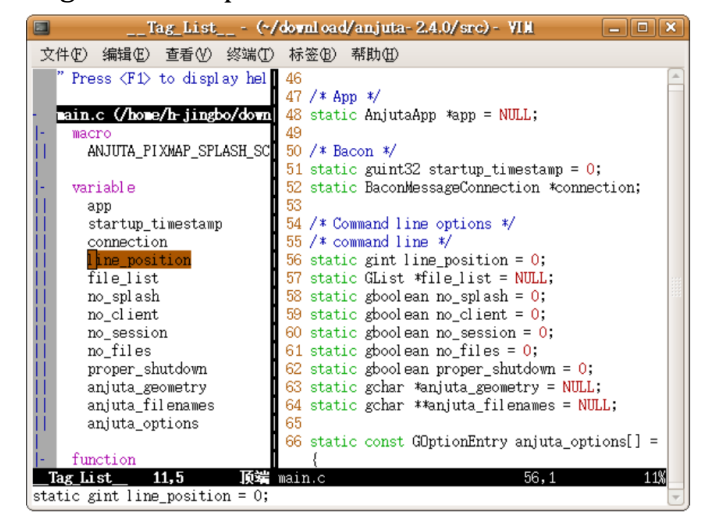
Figure 2.VIM code editing interface