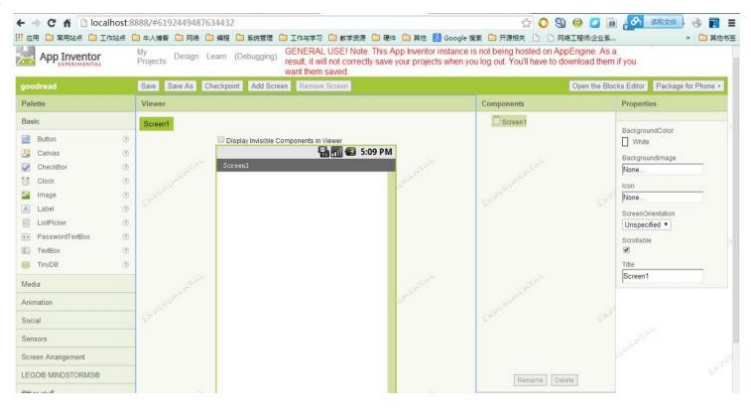
Figure 4. Applicantor's main interface

To develop client applications running on smart phones, the choice of target operating platform is mainly to consider the market share of IOS and Android systems, especially the target group of this project-the actual situation of college students at school to measure this project Android is preferred as the target operating platform for the first mobile terminal application to be developed and supported.