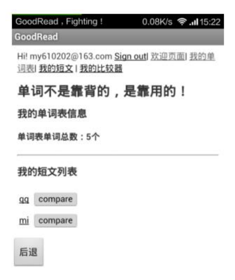
Figure 12. Smart phone APP running interface

Drag the Button control from the control list on the left to the bottom of the WebView control, change the button title to Back, click the button delineated by the red circle to open the code editing (Blocks) window, you can start the code like playing a drawing game Preparation. Next, click the button circled in the upper right corner of Figure 5-16 to open the interface in Figure