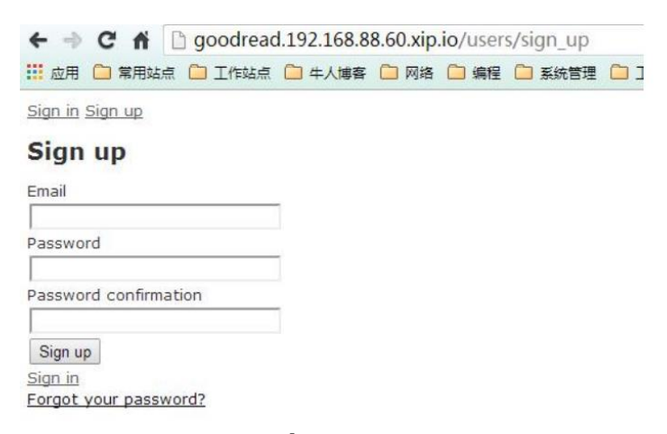
Figure 7. Website registration page